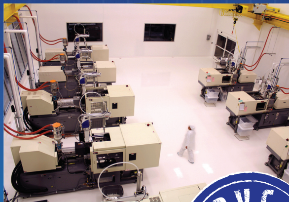
ISO Class 7 Cleanroom Extrusion and Injection Molding